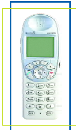
▲ wireless telephone